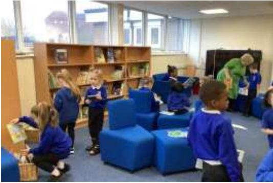
Year 1 enjoying the school's new library.

Email: office@smp.nelcmail.co.uk Website: saintmarysprimarygrimsby.co.uk